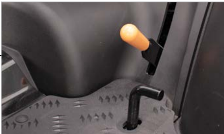
Differential lock is standard with foot pedal engagement for SA223, SA325, and SA425.