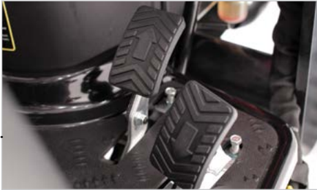
Switch seamlessly between forward and reverse with two side-by-side hydrostatic transmission pedals.