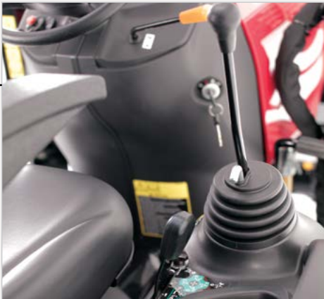
Work comfortably with armrest-mounted loader control lever, while True Position Control lever (below joystick) delivers precise operating height of rear implements.