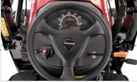
Simple to operate; easy access to every control.