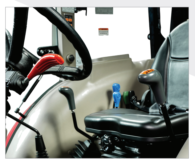
MECHANICAL SUSPENSION SEAT OFFERS MAXIMUM COMFORT.