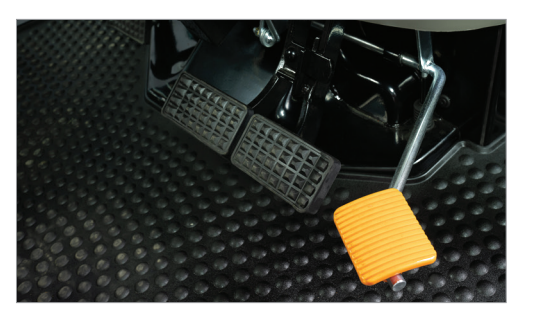
FOOT THROTTLE OFFERS EASE OF WORK.