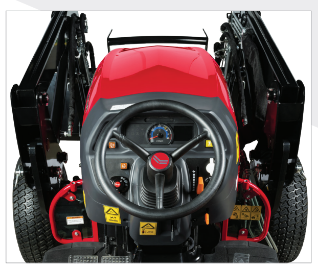
OPERATOR'S CONTROLS ALL WITHIN REACH.