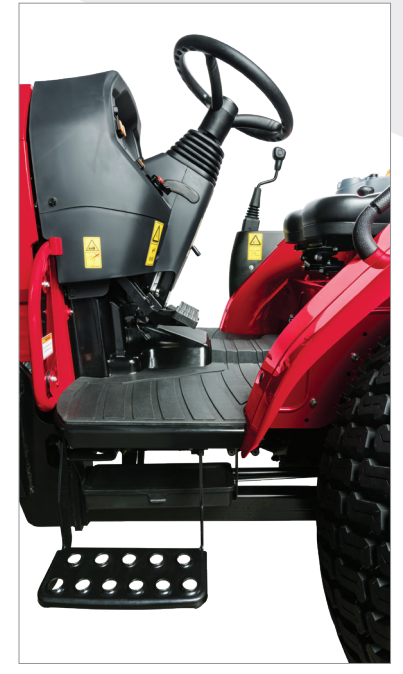
OPERATOR'S STEP OFFERS EASE CLIMBING ON AND OFF THE TRACTOR.