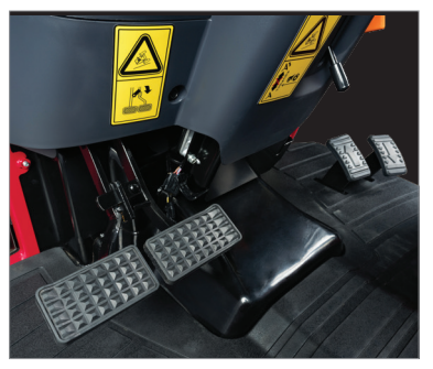
DUAL BRAKES OFFER A TIGHT TURNING RADIUS.